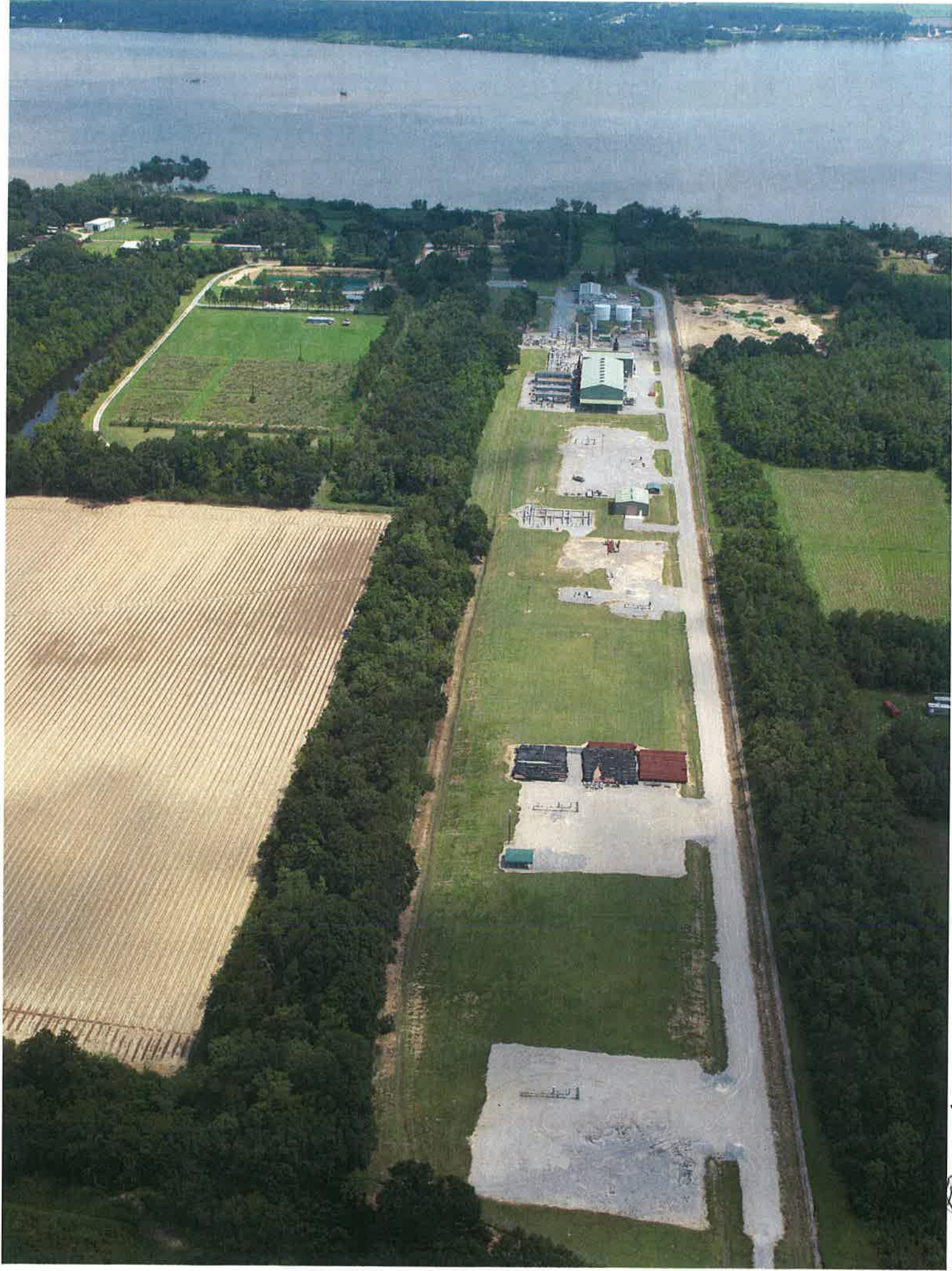
FROM AER TOUR